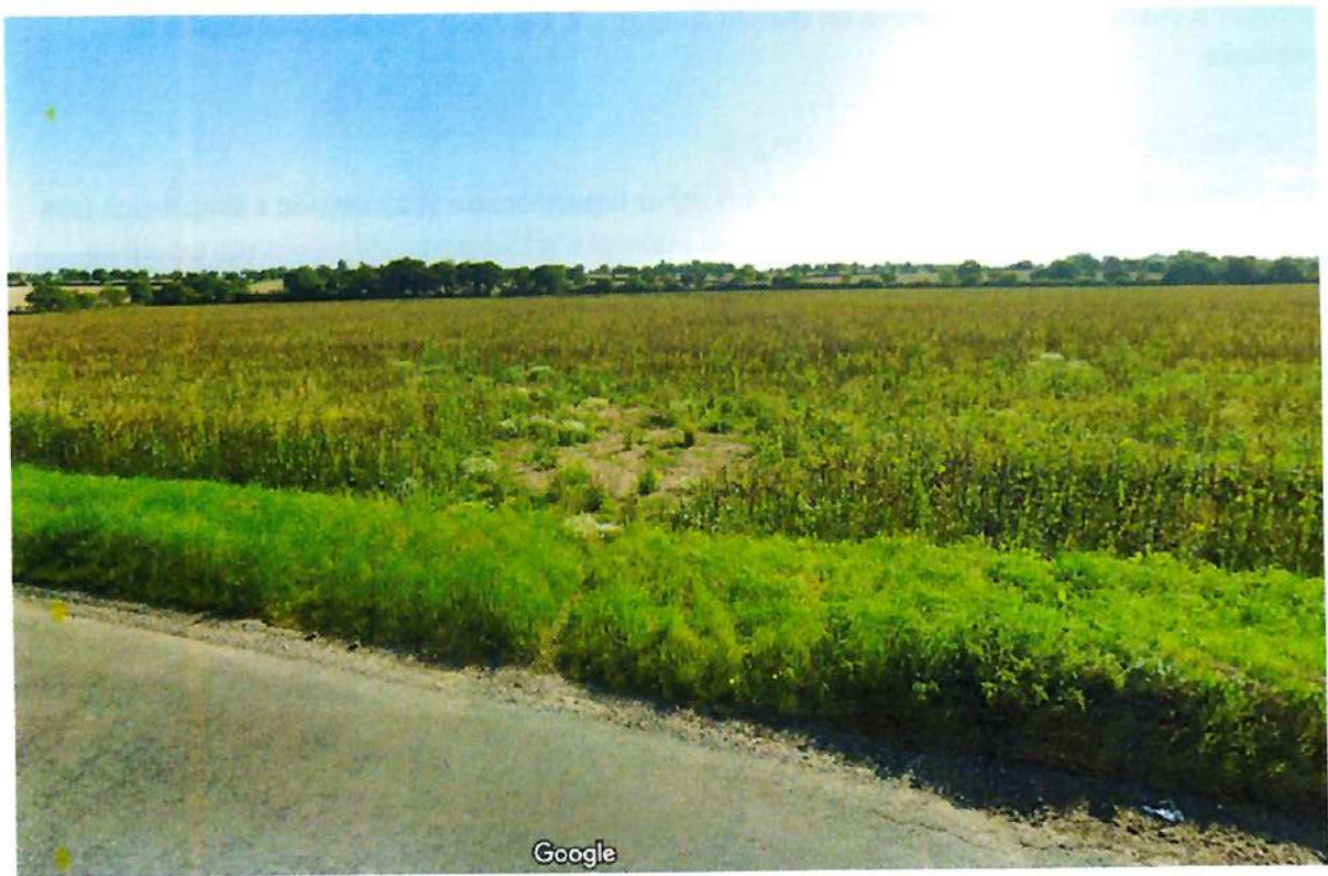
Figure 2 - End of Proposed Path on New Rd, Worlingworth [Google Street View].